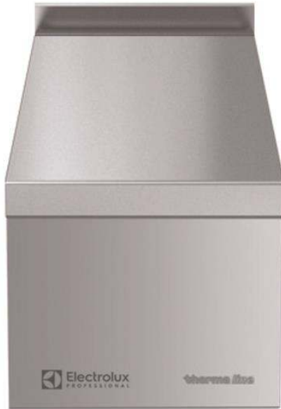
588562 (MBNABBCOOO) Closed Work Top, one-side operated with backsplash